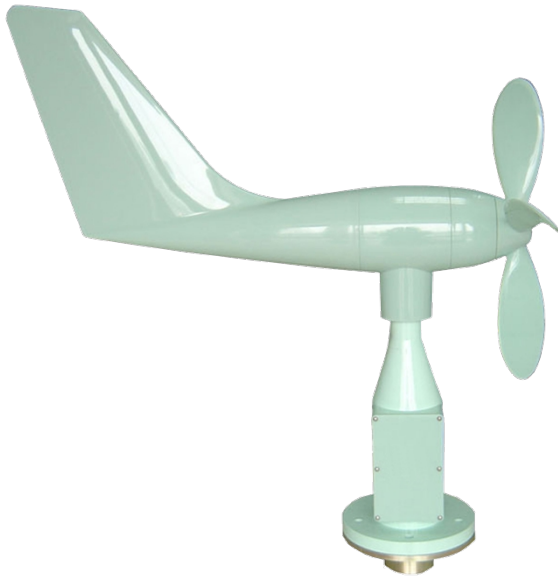
AM-100T ANEMOMETER TRANSMITTER