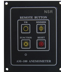
AM-100R REMOTE BUTTON