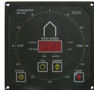
AM-100D DISPLAY UNIT